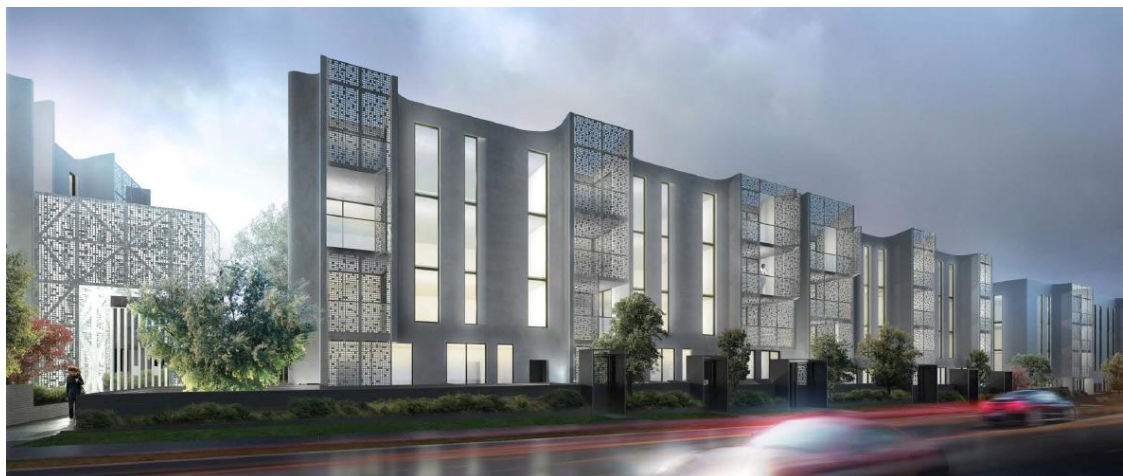
Figure 1: Perspective view of the proposed streetscape façade, which demonstrates that the projecting balconies are a primary source of visual interest in the design of the building